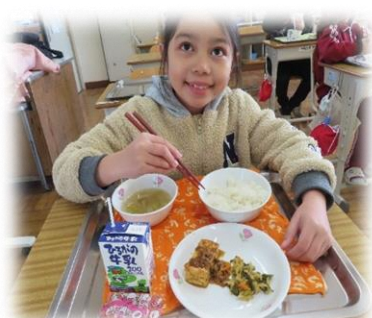
▲school lunch is delicious