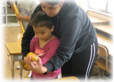
▲Way of using umbrella