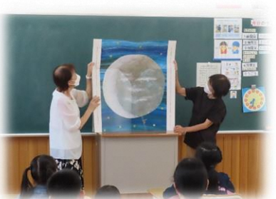
▲local people, reading story aloud