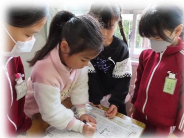
▲exciting school day