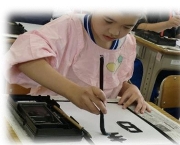
▲calligraphy is fun