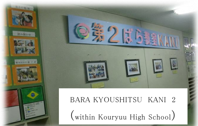
BARA KYOUSHITSU KANI 2 (within Kouryuu High School)

• If there are worries in your school life and Japanese language, you can study in Bara Kyoushitsu while you are enrolled in school. At the time of studying, this will be considered as your attendance in school.