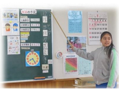
▲Morning meeting 「today is」