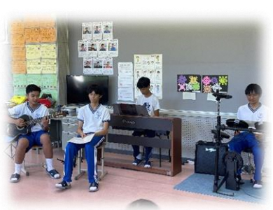
▲I can do it! presentation