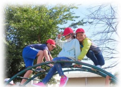
▲breaktime with friends