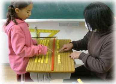
▲mathematics, how many ?