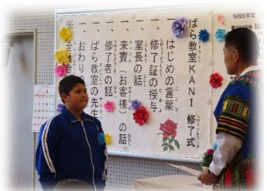
▲congratulating on graduation ceremony