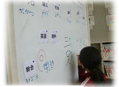
▲I learned kanji