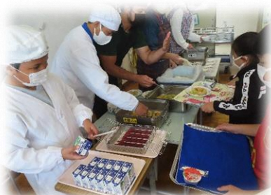
▲in-charge in school lunch