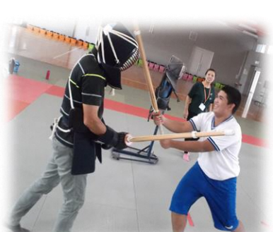
▲ PE kendou「me-n」