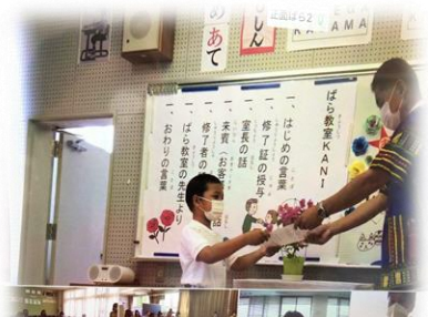
▲congratulating on graduation ceremony