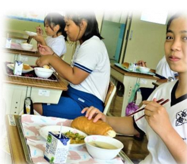
▲school lunch is delicious