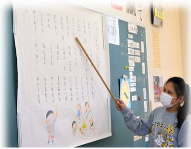
▲Morning meeting 「a,i,u,e,o」