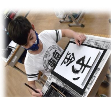
▲calligraphy is fun