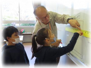
▲mathematics, how many centimeters?