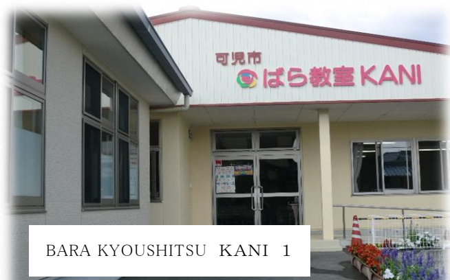
BARA KYOUSHITSU KANI 1

The city of Kani is providing support to children who cannot speak Japanese language.