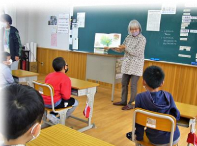
▲local people, reading story aloud