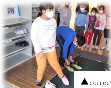
▲correct way Putting on shoes