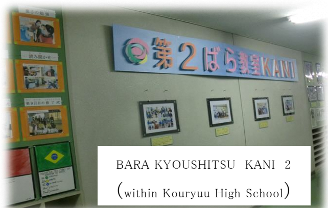
BARA KYOUSHITSU KANI 2 (within Kouryuu High School)

• If there are worries in your school life and Japanese language, you can study in Bara Kyoushitsu while you are enrolled in school. At the time of studying, this will be considered as your attendance in school.