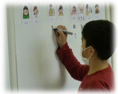
▲I learned hiragana