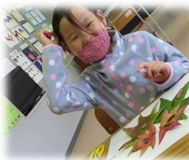
▲4th period, using of leaves