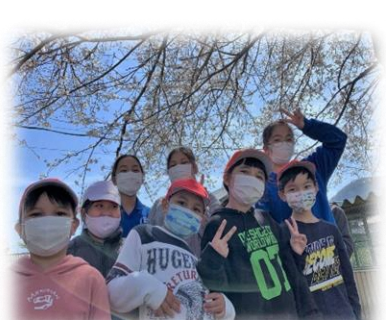
▲breaktime with friends