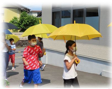
▲ Way of using umbrella